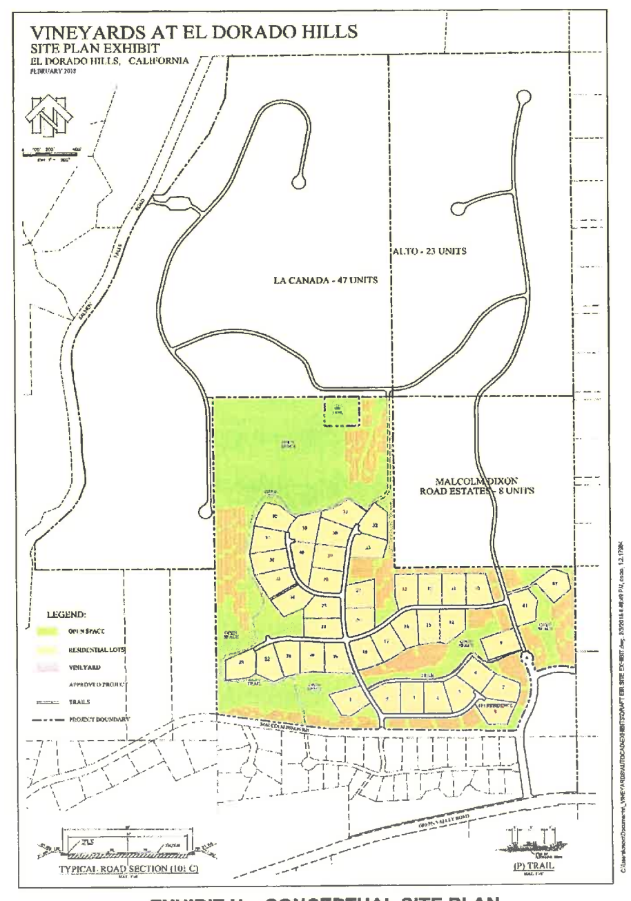
EXHIBIT H - CONCEPTUAL SITE PLAN